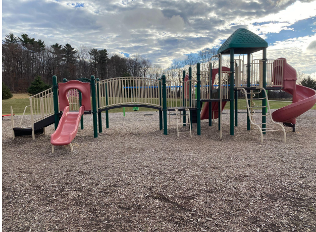
Ages 2-5 Equipment